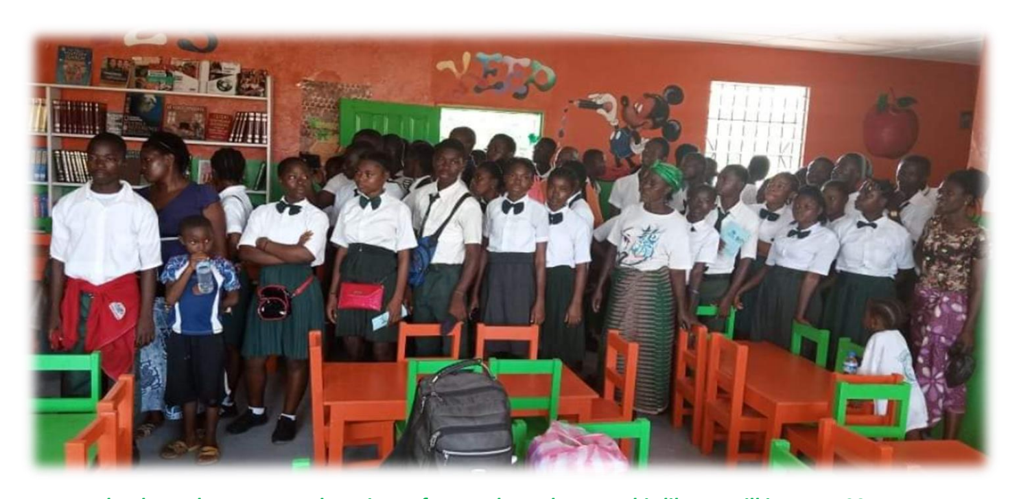
Thanks to the generous donations of many through HEAL, this library will impact 500 young minds at the HQ Taylor Junior and Senior High School.

The impact of this new reading room will extend far beyond the school walls. It has the potential to ignite a passion for reading within the community, fostering a culture of knowledge and exploration that benefits everyone.